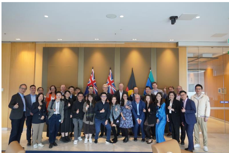
Photo 5: HKSTP delegation met with representatives from the startup community, universities, government bodies and investors in Australia to further explore business and collaboration opportunities and shared experiences and exchanged ideas with Australian tech ventures who are interested in learning and exploring the Hong Kong market.